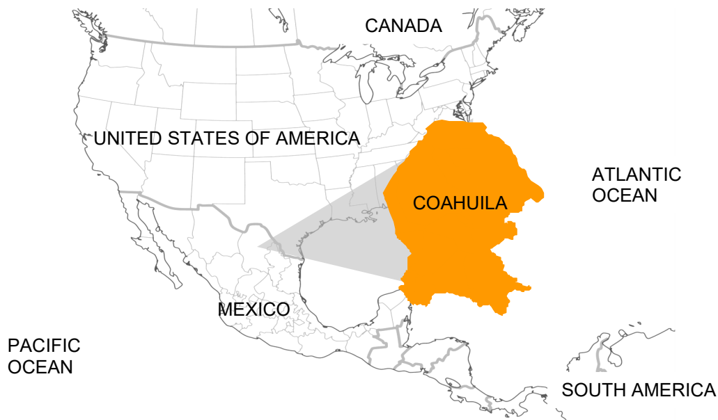
Location of Coahuila de Zaragoza in North America

Coahuila de Zaragoza is the third largest state in the country, located in northeastern Mexico and shares a 512-kilometer border with the U.S. state of Texas. In Mexico it borders the states of Chihuahua, Durango, Zacatecas, San Luis Potosí and Nuevo León.