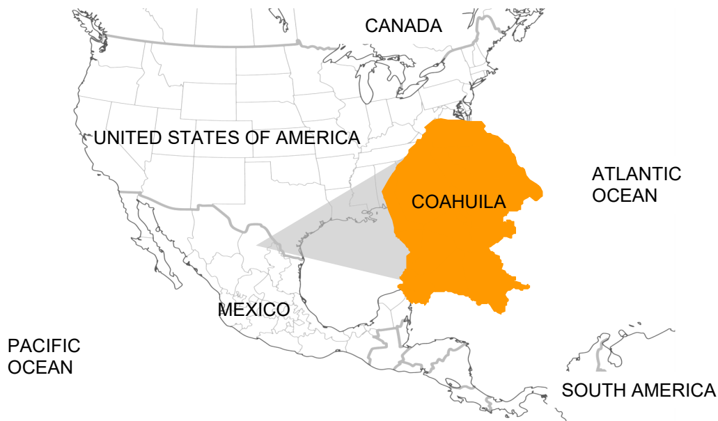
Location of Coahuila de Zaragoza in North America

Coahuila de Zaragoza is the third largest state in the country, located in northeastern Mexico and shares a 512-kilometer border with the U.S. state of Texas. In Mexico it borders the states of Chihuahua, Durango, Zacatecas, San Luis Potosí and Nuevo Leon.