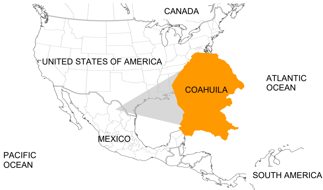
Map 1. Location of Coahuila de Zaragoza in North America

Coahuila de Zaragoza is the third largest state in the country, located in northeastern Mexico and shares a 512-kilometer border with the U.S. state of Texas. In Mexico it borders the states of Chihuahua, Durango, Zacatecas, San Luis Potosí and Nuevo Leon.