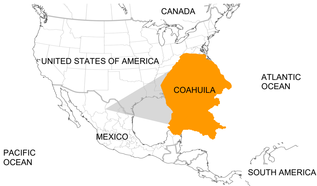
Location of Coahuila de Zaragoza in North America

Coahuila de Zaragoza is the third largest state in the country, located in northeastern Mexico and shares a 512-kilometer border with the U.S. state of Texas. In Mexico it borders the states of Chihuahua, Durango, Zacatecas, San Luis Potosí and Nuevo Leon.