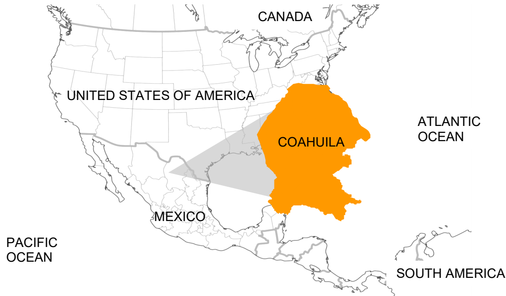
Location of Coahuila de Zaragoza in North America

Coahuila de Zaragoza is the third largest state in the country, located in northeastern Mexico and shares a 512-kilometer border with the U.S. state of Texas. In Mexico it borders the states of Chihuahua, Durango, Zacatecas, San Luis Potosí and Nuevo Leon.